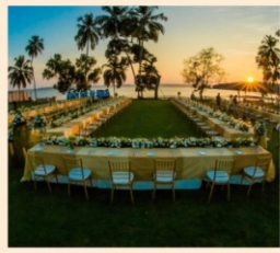
The Wedding Venues

Flowers, Music, Photograph Our Wedding Planner has comprehensive database wedding specialists in Goa and co-ordinate floral arrangement, photographers, videographers and entertainment requests. Once you have secured your wedding date, our Wedding Planner would be happy to assist in handling all the details for your wedding.