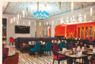
Hotel Wedding Venues