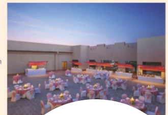
Hotel Wedding Venues